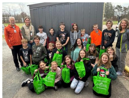
Twenty students from River Valley Middle School participated in Sauk Prairie Healthcare Foundation's Youth Empowerment class. The group learned how (and why) to make smoothies at River Valley Middle School.

SPH will continue to provide Smoothie Classes to student groups in 2025.